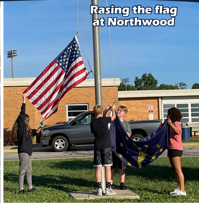
Raising the flag at Northwood