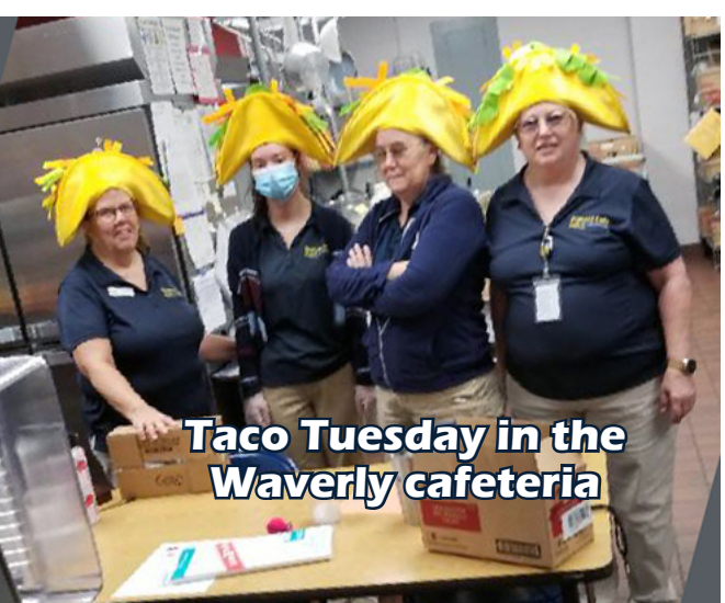
Taco Tuesday in the Waverly cafeteria