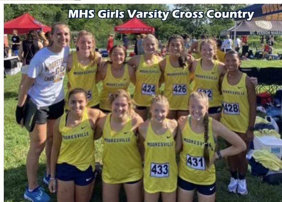
MHS Girls Varsity Cross Country